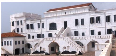
Cape Coast Slave Castle