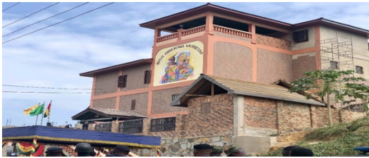
Bisa Aberwa Museum